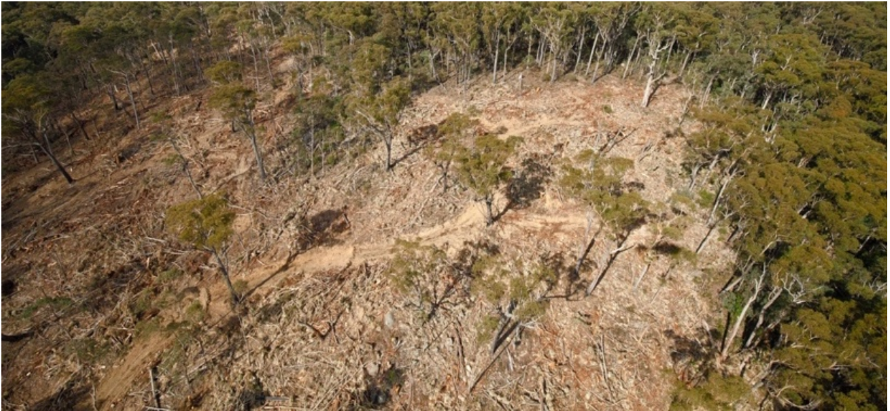
Photo 2: Part of an image of logged Glenbog State Forest, 2016: photo the late Carolyn Green. Full image at http://www.greatsouthernforest.org.au/media/GSF_Brief.pdf

The current RFA proposal shows that the Governments assume communities in the southeast region of NSW favour Photo 2 over Photo 1.