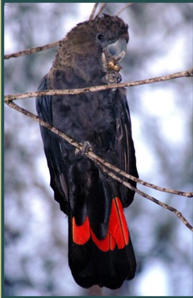
Glossy Black-Cockatoo: Stuart Harris