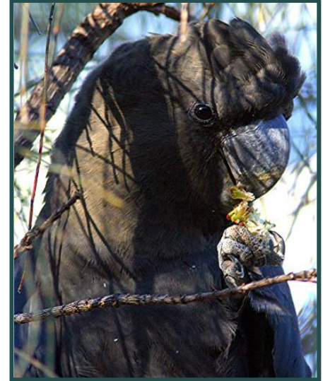
Glossy Black-Cockatoo: Geoffrey Dabb

The Glossy Black-Cockatoo is listed as vulnerable in NSW and the ACT. A number of factors have contributed to its vulnerability, including historical land clearing, ongoing loss of hollow-bearing trees, urbanisation and over-grazing. Its vulnerability is also related to its specialist feeding habits: it feeds exclusively on Sheoak species, which are particularly susceptible to browsing and lack of recruitment from inappropriate grazing. The Glossy Black-Cockatoos' main source of food in our region is the Drooping Sheoak.