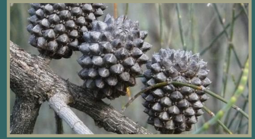
Drooping Sheoak Cones: Greening Australia