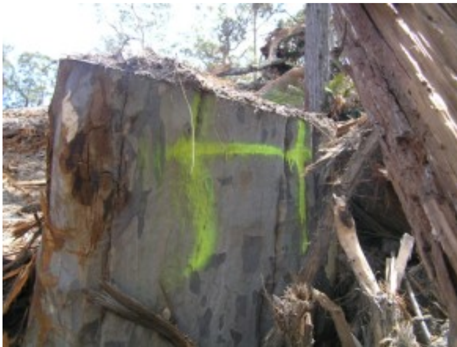
Mogo SF – Habitat Tree Retention

Political will is crucial to improving forest law compliance and ensuring that measures taken have positive outcomes for conservation that are long-lasting. As there has been little compliance and continuous over-logging, the only positive outcome for conservation would be to end native forest logging. The challenge now for public native forest conservation is to transfer all State owned land to National Parks co-managed with traditional owners.