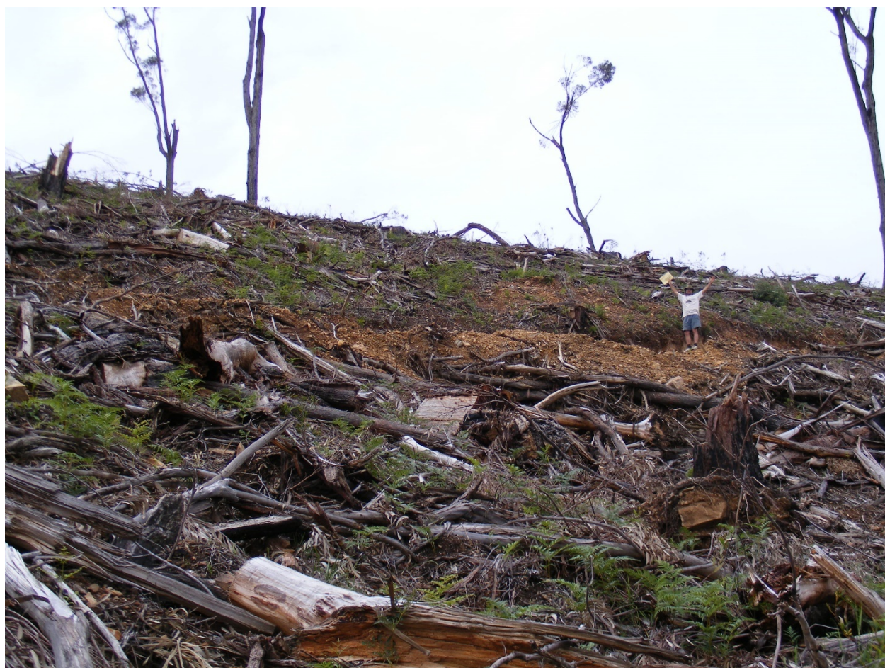
Gnupa SF – 4 trees per 2 hectares

We assert that urgency is needed in this forest reform. In our view, the RFA experiment has failed.