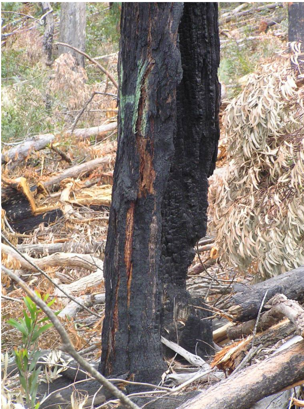
Dampier SF – 'Habitat Tree'