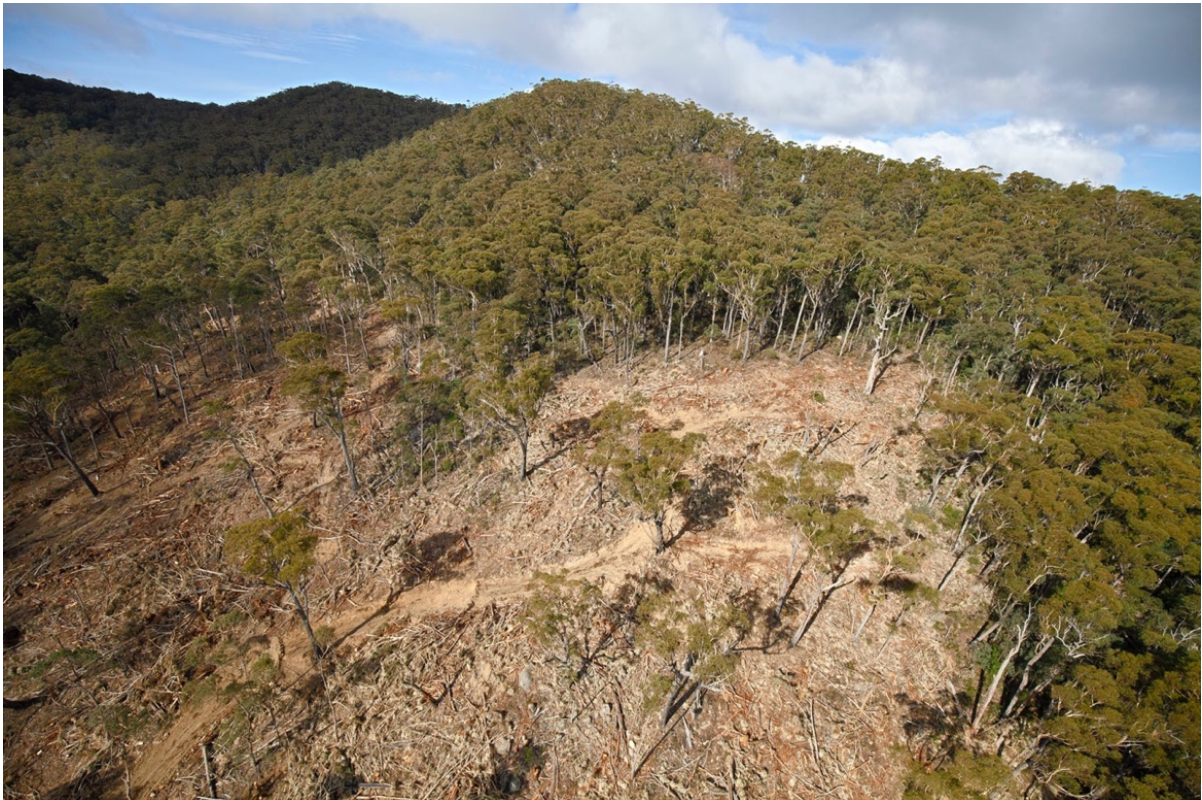
Photo 1: Logged Glenbog State Forest, 2016